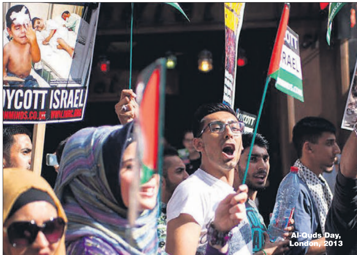
Al-Quds Day, London, 2013