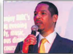
Islamophobia Awards PAGES 8-9