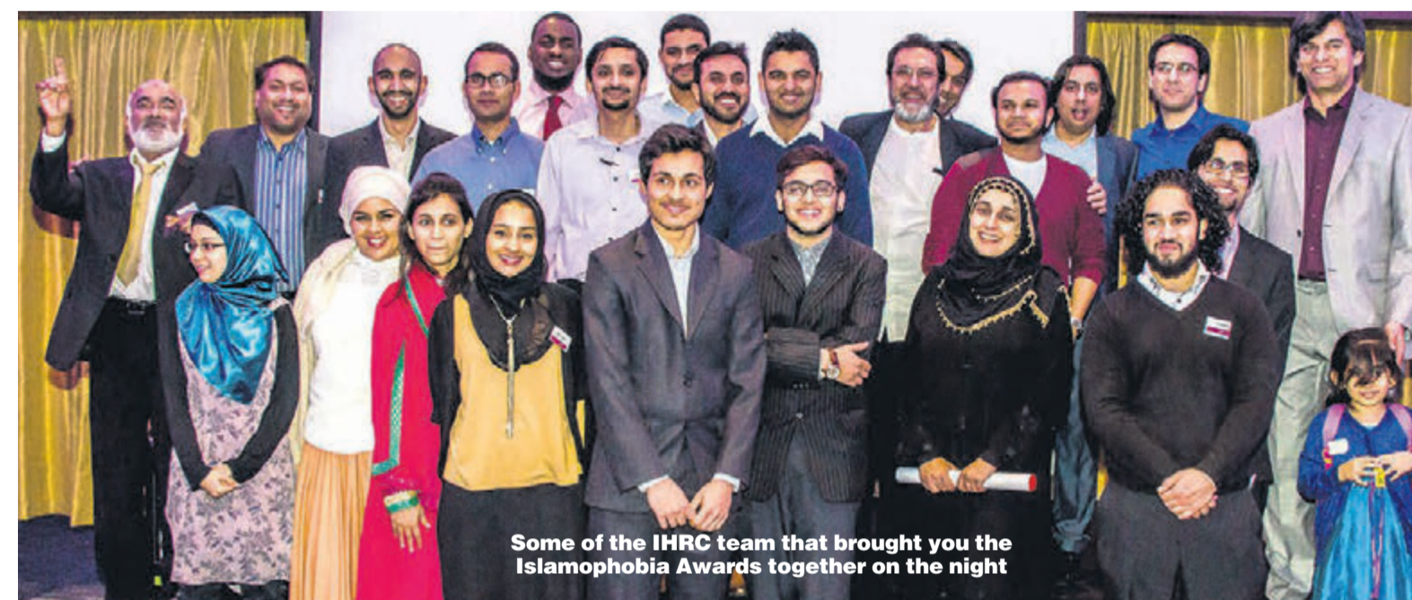
Some of the IHRC team that brought you the Islamophobia Awards together on the night

Abroad, in Muslim countries the counter revolutions against the Arab Spring spawned a new wave of terror against Islamist groups, particularly in Egypt. In Bahrain the crackdown on reform protestors continued despite pledges by the ruling monarchy to institute human rights and political reforms, and the authorities there were nominated for allow-