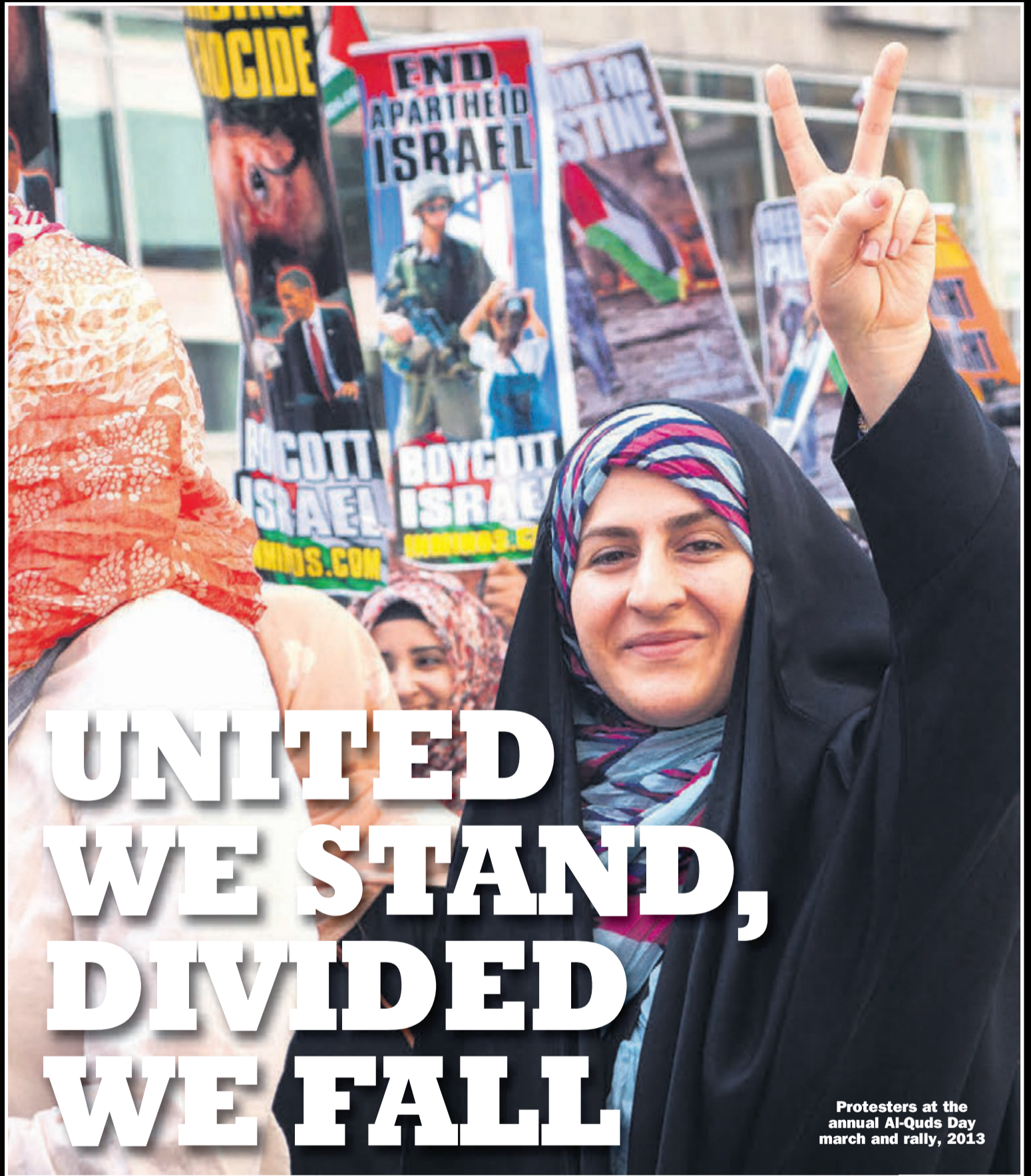
Protesters at the annual Al-Quds Day march and rally, 2013

The Islamic Human Rights Commission is an NGO in Special Consultative Status with the Economic and Social Council of the United Nations