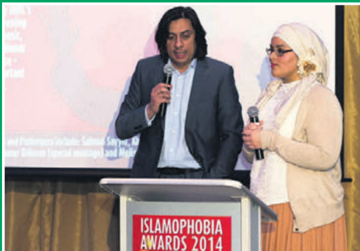
Relive the Islamophobia Awards on the IHRC TV channel