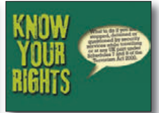
Defending Muslim Rights PAGE 12