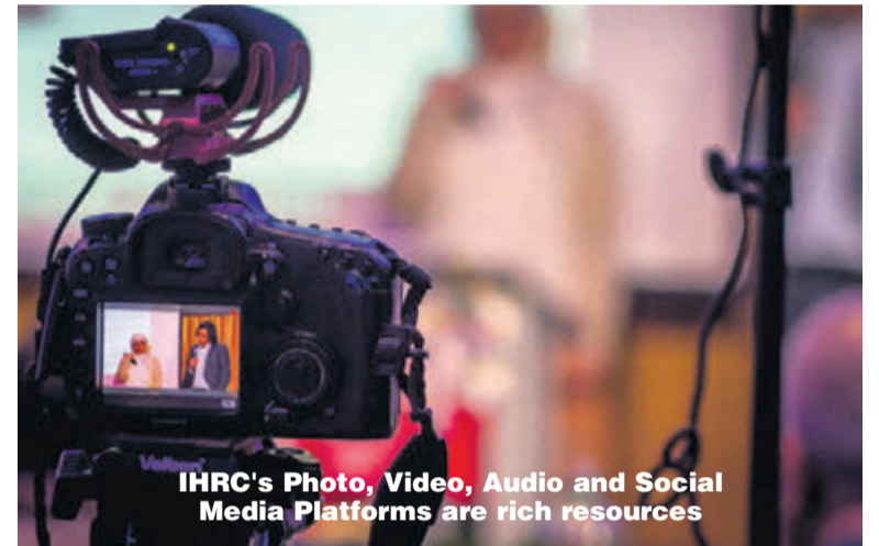
IHRC's Photo, Video, Audio and Social Media Platforms are rich resources

We also have an extremely active presence on Facebook – thankfully, perhaps, for those of you who would like meatier