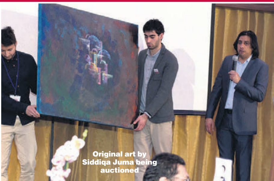
Original art by Siddiq Juma being auctioned