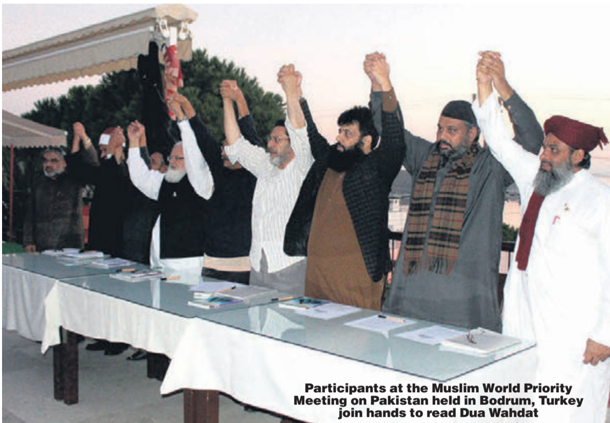
Participants at the Muslim World Priority Meeting on Pakistan held in Bodrum, Turkey join hands to read Dua Wahdat

The declaration denounced the killing of fellow human beings on the basis of colour, creed, ethnicity or religion as haram. The statements also declared excommunication or takfir against fellow Muslims and abusing the Prophet Muhammad's family and companions to be against the Shariah. The declaration is based on Charter 3:103, an IHRC project initiated in 1997 that is based on