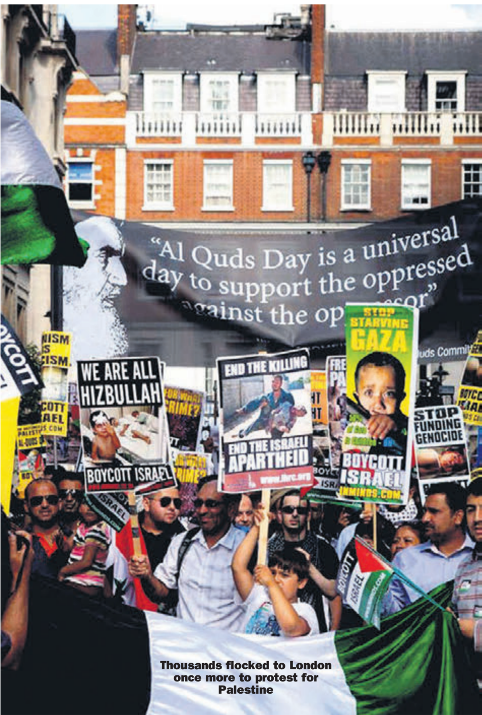
Thousands flocked to London once more to protest for Palestine

For more information please contact events@ihrc.org or 020 8904 4222