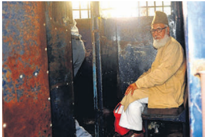
Motiur Nizami after sentencing in Bangladesh