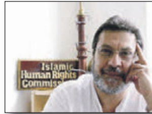
Message from the Chairman PAGE 5