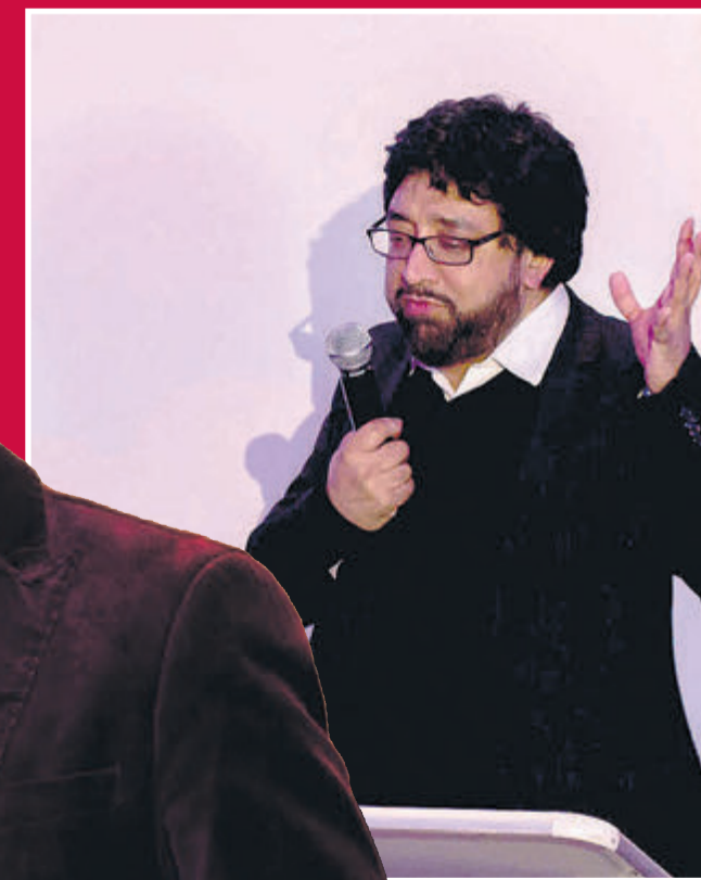
Actor and Director Danny John-Jules joined us on the night